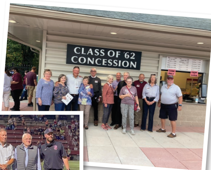
Class of '62 Concession