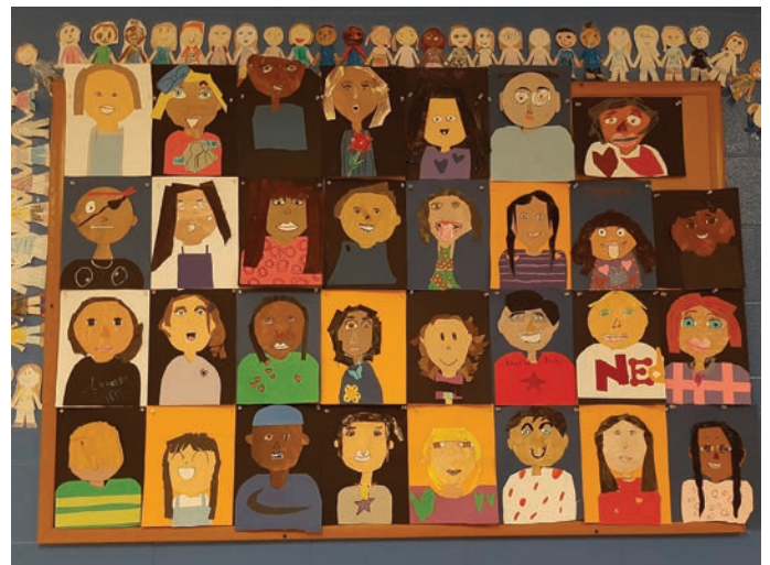
Selfportrait bulletin board at Easterly Parkway