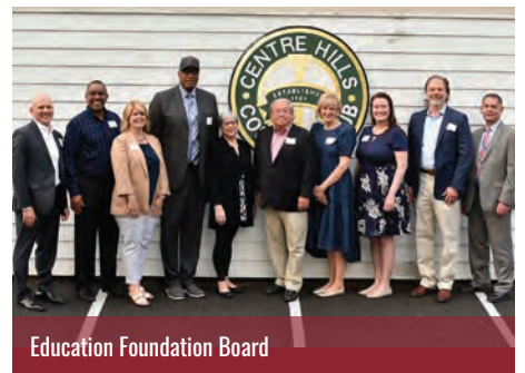
Education Foundation Board

2024 NOMINATIONS WILL OPEN SOON! WATCH YOUR EMAIL AND SOCIAL MEDIA FOR THE CALL FOR NOMINATIONS FOR THE 2024 MAROON & GRAY SOCIETY!