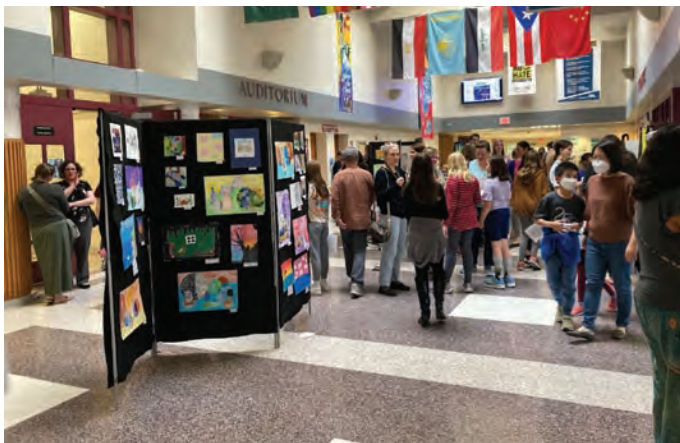
The 2023 Art Show at Mount Nittany Middle School on May 9

“Peer buddies is an excellent opportunity for special education and general education students to work together,” continued Madison. “This project adds value to these peer interactions by providing students with opportunities to work with a greater variety of art materials and create lasting artwork.” ●