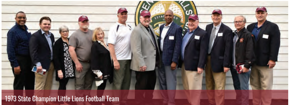
1973 State Champion Little Lions Football Team