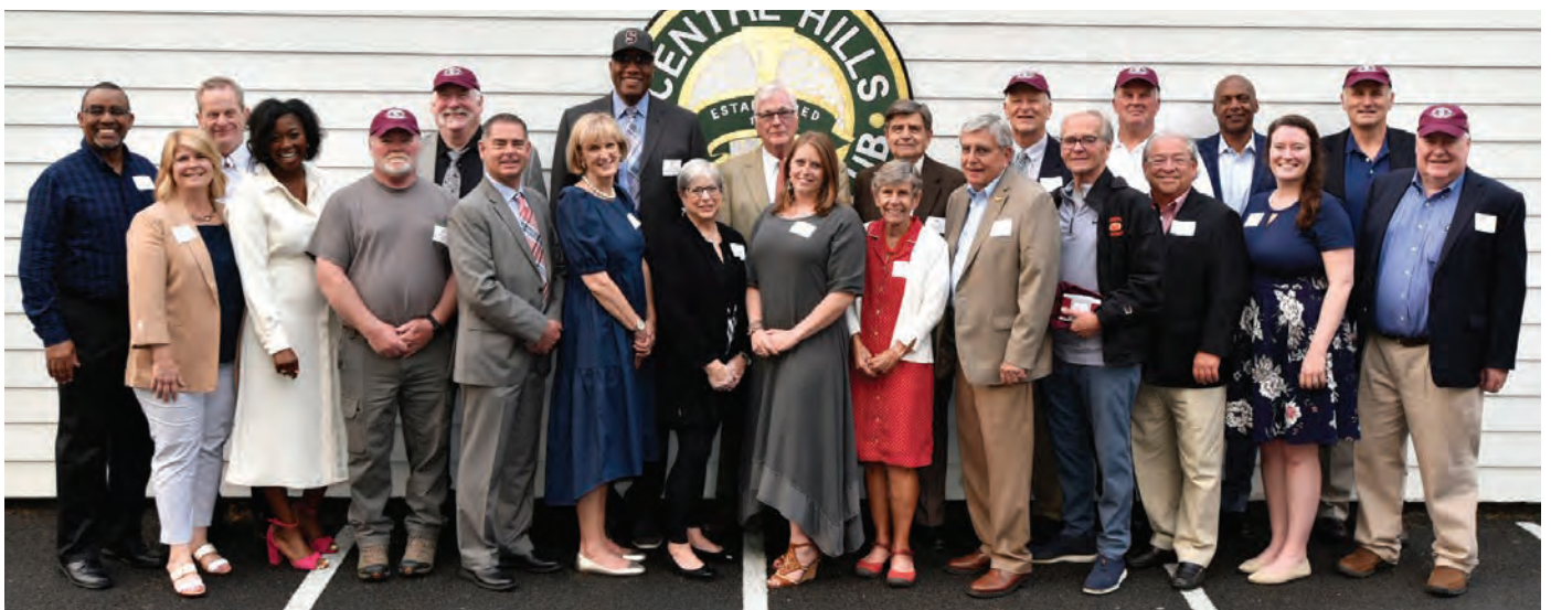
2023 Maroon & Gray Society Inductees (pictured with Education Foundation Board Members)