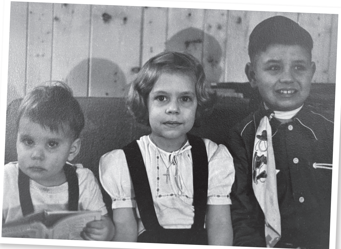
Three Captains as kids

"I LEARNED ABOUT THE COMRADERY THAT DEVELOPS AMONG TEAM SPORTS MEMBERS, AND MY FONDEST MEMORIES ARE OF MY FOOTBALL TEAMMATES."