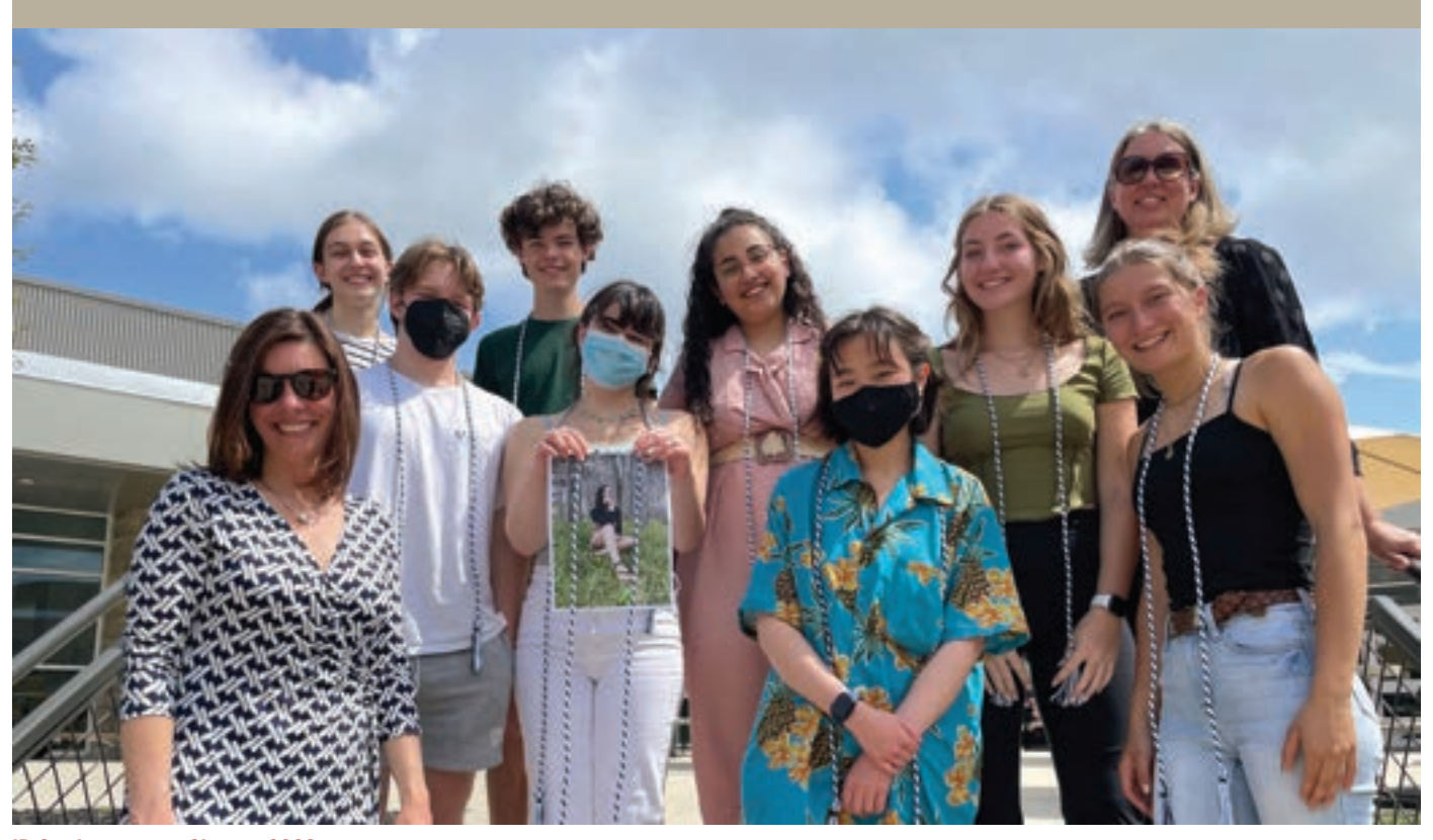
IB Cord recipients Class of 2022