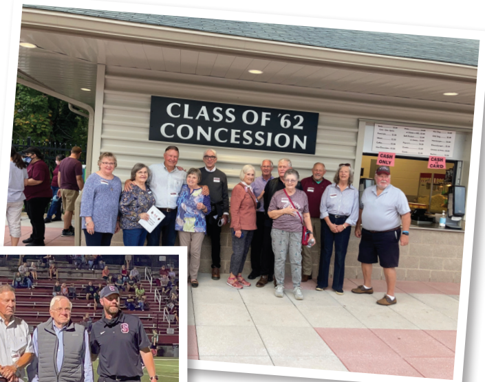
Class of '62 Concession