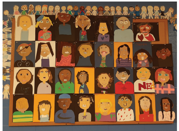
Selfportrait bulletin board at Easterly Parkway